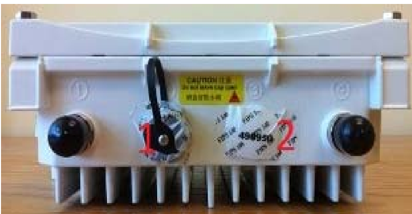
Figure 22 - Aruba AP-175 TEL placement back view