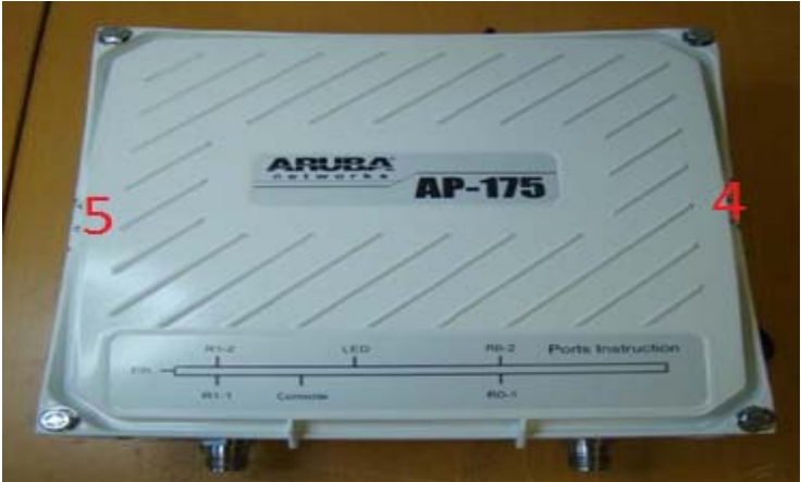
Figure 26 - Aruba AP-175 TEL placement bottom view