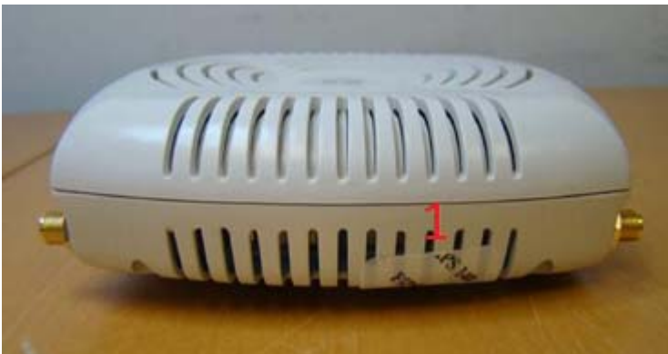
Figure 2 - Aruba AP-92 TEL placement left view