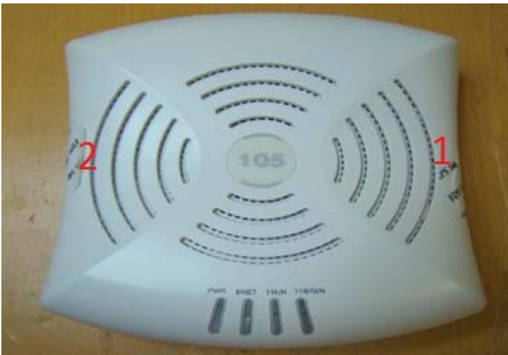
Figure 20 - Aruba AP-105 TEL placement bottom view