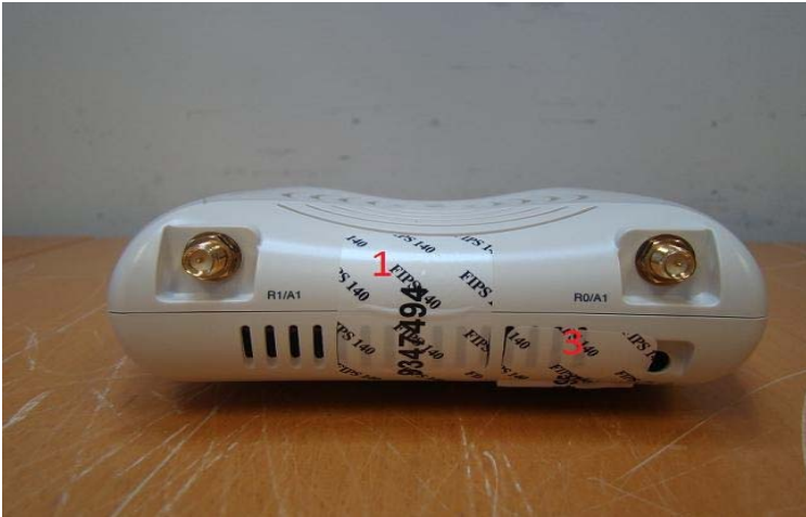
Figure 14 - Aruba AP-104 TEL placement top view