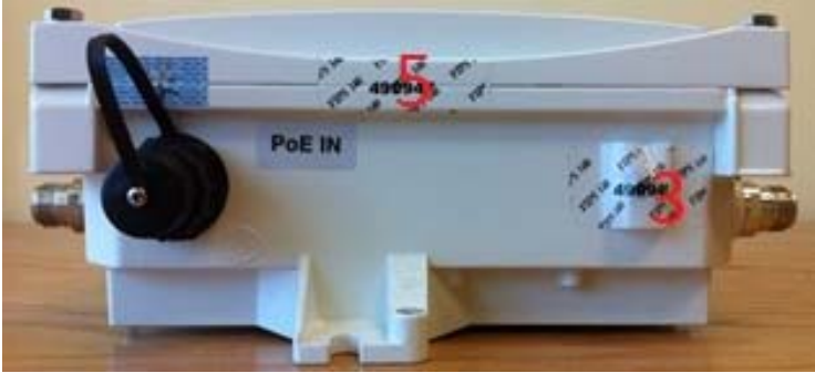
Figure 25 - Aruba AP-175 TEL placement top view