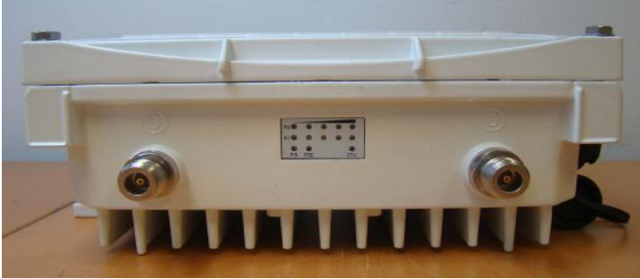
Figure 23 - Aruba AP-175 TEL placement left view