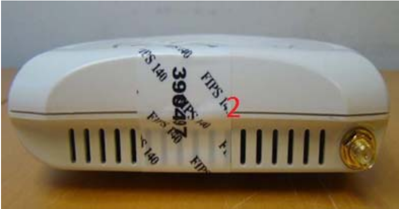
Figure 4 - Aruba AP-92 TEL placement top view