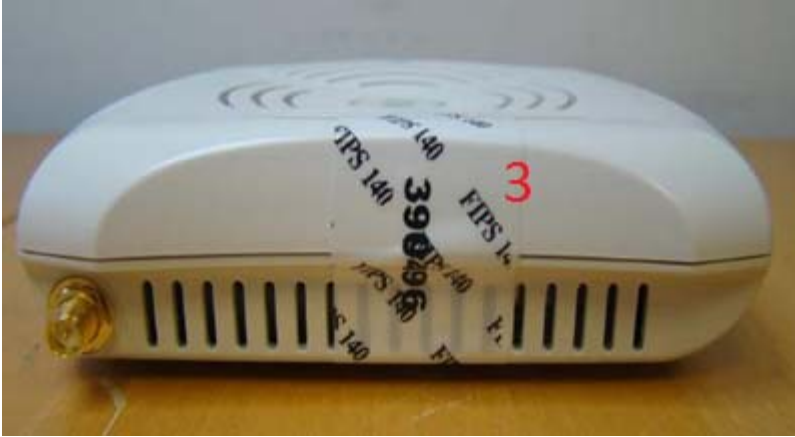
Figure 3 - Aruba AP-92 TEL placement right view