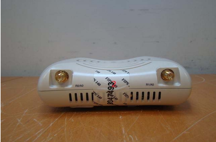
Figure 13 - Aruba AP-104 TEL placement right view