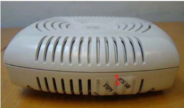
Figure 6 - Aruba AP-93 TEL placement front view

Following is the TEL placement for the AP-93: