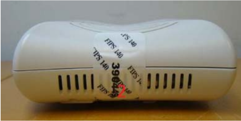
Figure 18 - Aruba AP-105 TEL placement right view