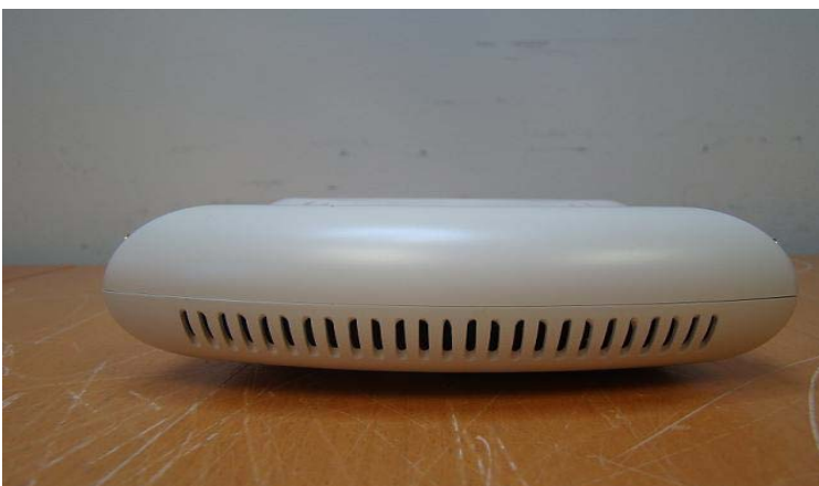
Figure 12 - Aruba AP-104 TEL placement left view