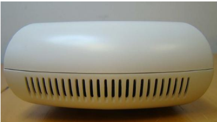
Figure 17 - Aruba AP-105 TEL placement left view