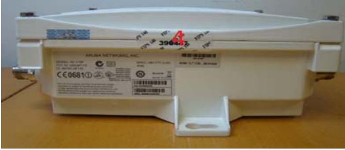
Figure 24 - Aruba AP-175 TEL placement right view